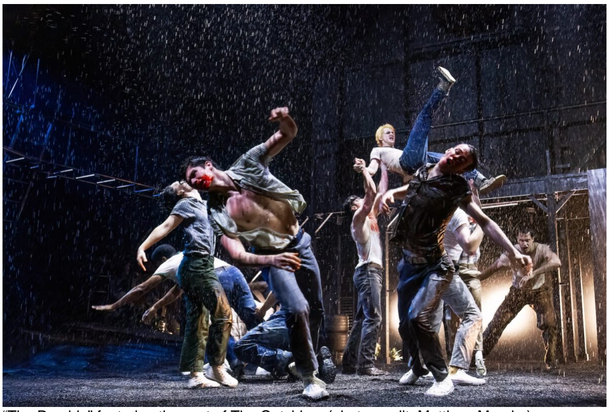
"The Rumble" featuring the cast of The Outsiders

For a remarkable third time, L-Acoustics is recognized as an industry trailblazer in the Events, Concerts, and Live Experiences category, following previous honors in 2020 and 2023