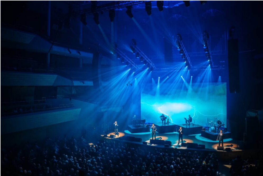
Il Divo relied on the L-Acoustics L Series professional sound

Event technology specialists Adlib provided their first full-service audio, lighting, and video solution for Il Divo and built their sound design around an L-Acoustics L Series system. The core configuration featured main hangs of up to three L2 and one L2D enclosures per side, complemented by 12 KS28 subwoofers, eight X8, and four X12 fill speakers. For larger venues, the system expanded to include Kara II side hangs of up to 12 enclosures per side with additional KS28 subwoofers. In arena settings, such as Amsterdam's Ziggo Dome, the system scaled up to K1 arrays for main hangs, with L2 repurposed effectively as side hangs.