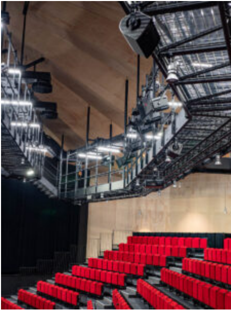
L-Acoustics X8 are mounted on the truss for delay in The Galabru theatre.