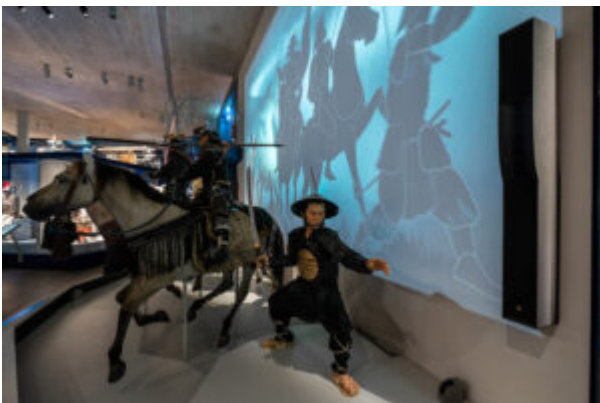
Faces of Battle features X4i, Syva and Syva Sub.

The interactive multimedia installation in the cinema room features projections and touchscreens enhanced with audio which is delivered through four compact X8 cabinets and a further Syva Sub, again designed to melt into the venue's décor. Here, visitors get a captivating insight into how the samurai have shaped the history of Japan through the centuries, learn about the supernatural Yokai of Japanese folklore, and follow the labour-intensive process of Japanese sword making.