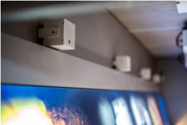
Close up of the Japanese Desk's X4i.

without spilling over into neighbouring exhibits. To achieve this, the sound pressure level can't be too high, so the audio has to deliver impact with clarity and transparency. L-Acoustics does this beautifully!