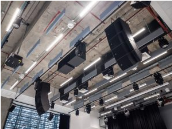
Close up of the main studio's L-Acoustics A15i Focus and A15i Wide each topped with a KS21i.

Boasting a fully equipped studio theatre, study, multiple resource centres, and a state-of-the-art health suite, the Countess of Wessex Studios provides vital space to grow, nurture creativity, cultivate dreams, propagate ideas, and allow talent to blossom. The only thing missing from this world-leading training centre was an equally impressive sound system. UK-based supplier of sound, lighting, and audio-visual equipment, Adlib, was called on to work with Central to deliver an L-Acoustics Ai Series system that offers a multifaceted audio solution throughout the new venue.