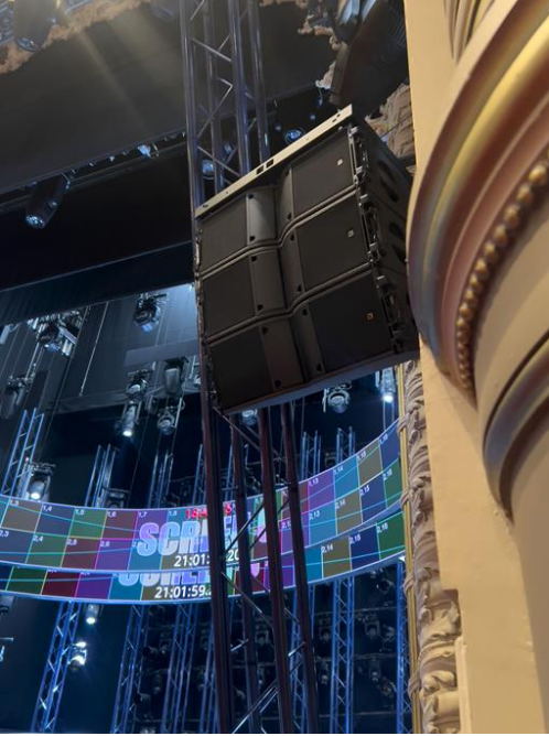
Two additional hangs of three Kara II along with SB18 subwoofers cover the stalls