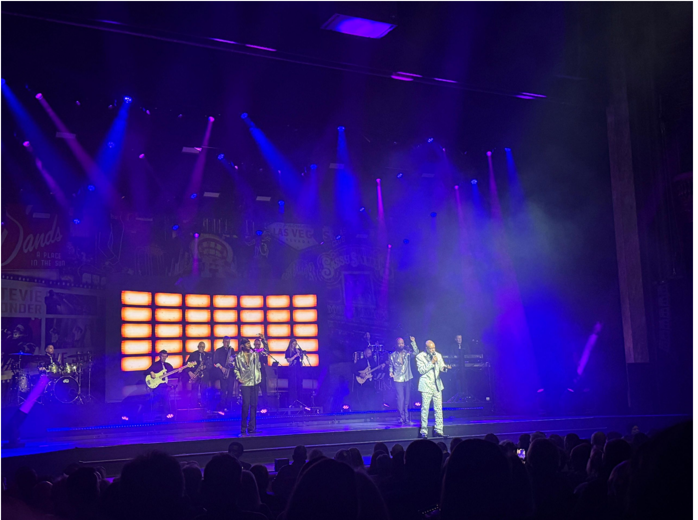
Performers of Magic Of Motown

“The system is so intuitive that each person can interact with it exactly how they like,” he concludes. “For me, that independence was a key consideration when investing in KLANG. I need to concentrate on the front of house mix, so knowing that my artists can take control of their mixes and have fun is great. I can still keep an eye on them all and if needed, I can make changes from the console, but it isn’t distracting for me. The workflow of DMI-KLANG has been