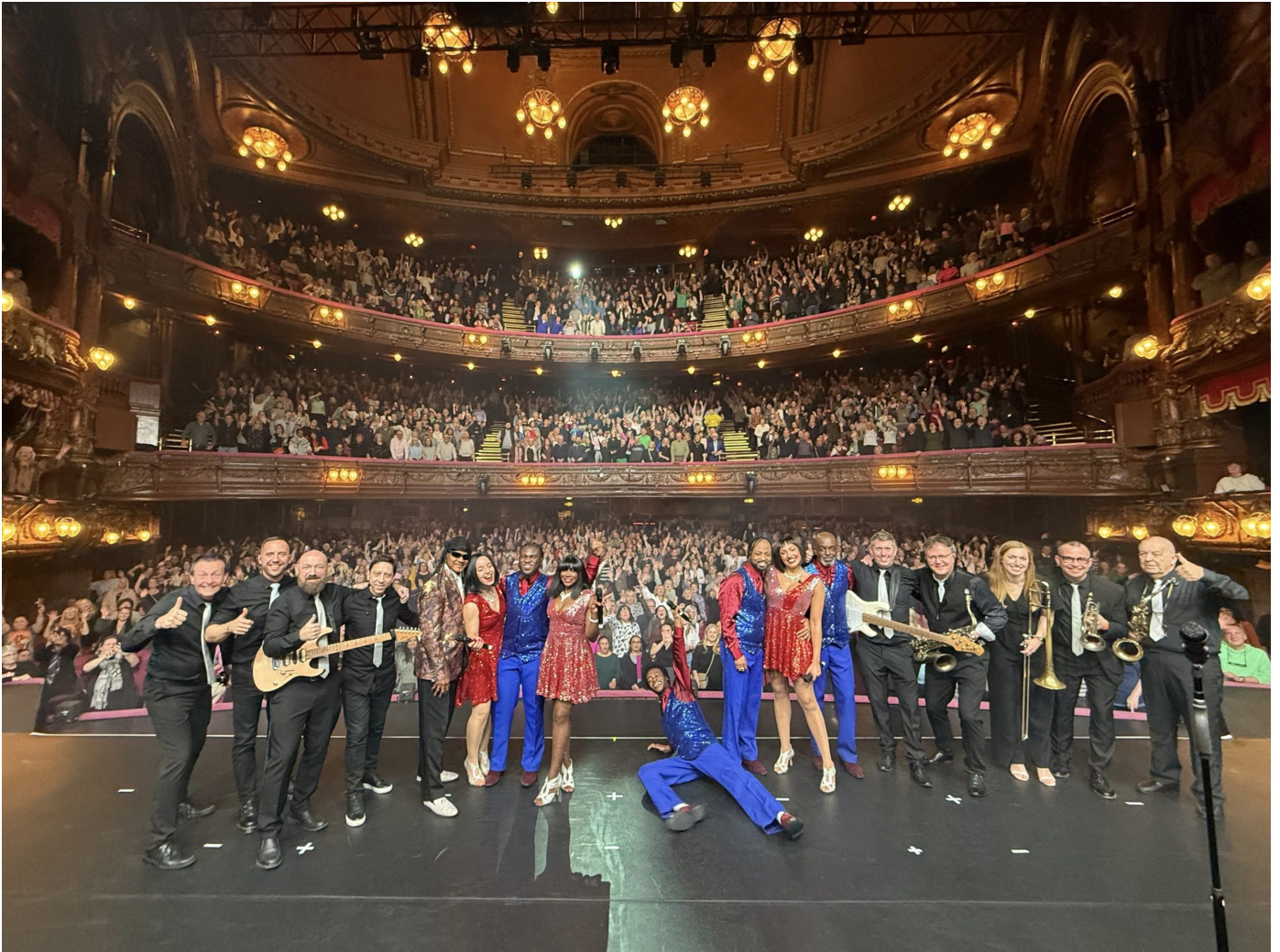
Performers of Magic Of Motown

"It's not just the band, we also usually have seven singers, but this can increase to eight," Lewis says. "Being able to space the singers effectively in their mixes has been brilliant. They can hear everything clearly to harmonise, but don't overpower each other. When we first tried it, their reactions were instantly positive."