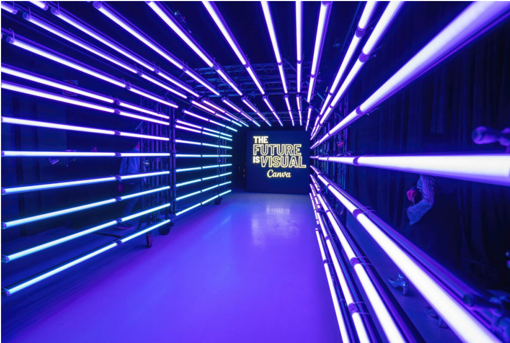
Canva Create – Produced by The Event Room

When LDs, lighting directors, operators or clients know that a company has Astera onboard, “everyone takes you seriously – the name has proper kudos and industry standard status,” he enthused.