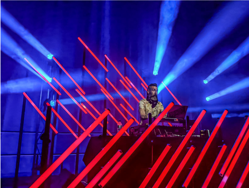
Sightline Productions – DJ set up

AX1 tubes were also used for the Netflix season launch of the newest Stranger Things series where they – together with other Astera fixtures – help to create an actual “upside down world”.