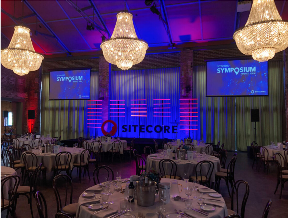
160 Sitecore Conference produced by Pivot Productions

In addition to these, they also have AX2 LED battens, AX3 LiteDrops, AX5 TriplePARs, AX9 PowerPARs, as well as the 2 metre Hyperion Tubes and the half metre Helios Tubes, totalling over 200 Astera battery-powered LED products.