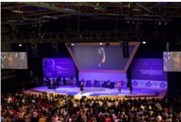
'Is'thunzi Sabafazi'-translated to "Dignity of a Woman"

The Kara system was used by Blackmotion Production in the Nelson Mandela Foundation's event, 'Is'thunzi Sabafazi'-translated to "Dignity of a Woman"- hosted at the University of Johannesburg's Soweto campus. The event celebrated women and spoke out against the systemic injustices that many women face. The event had key speeches by several extraordinary women, including Oprah Winfrey.