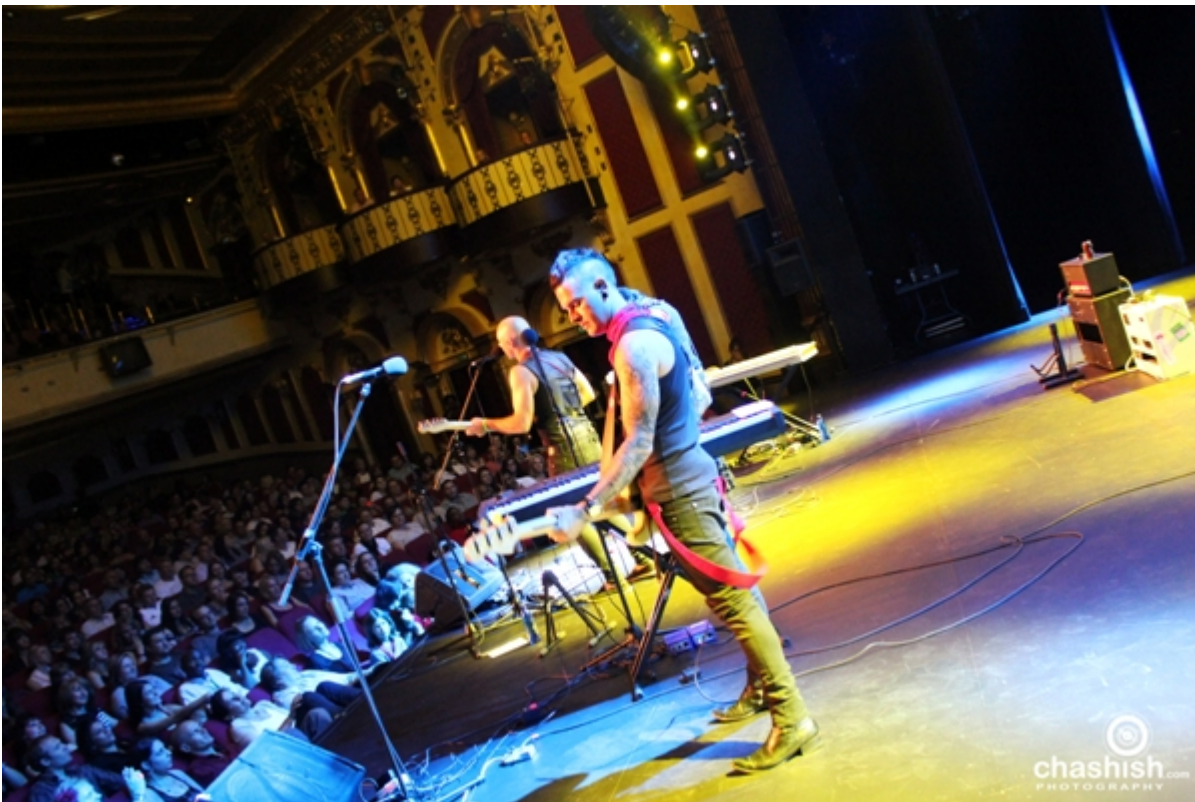
followed by The Feb) and a