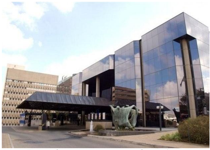
Joburg Theatre Complex, Johannesburg, South Africa

The Nelson Mandela Theatre at the Joburg Theatre Complex in Braamfontein remains one of the most prestigious and celebrated stages in South Africa. Home to the Joburg Ballet Company, the much-celebrated annual Pantomime and one of the best-equipped opera stages in the country, the theatre complex is a flame of hope that continues to keep the performing arts alive and well in the city.