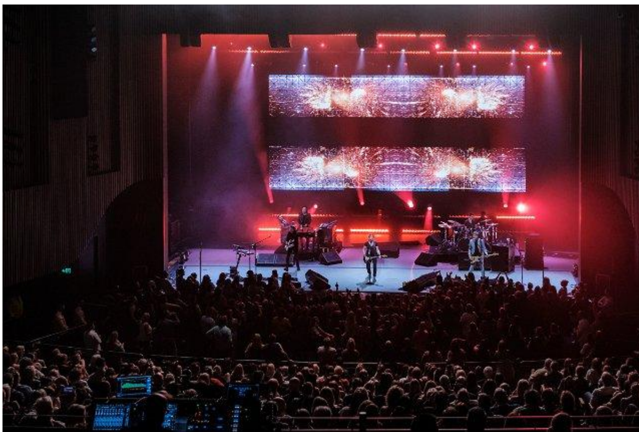
Sydney Coliseum 5.jpg – Keith Urban, Amy Shark and John Butler performing at Sydney Coliseum, Rooty Hill with the sound delivered by L-Acoustics L-ISA technology

Spectacularly designed and architecturally breathtaking, the new Sydney Coliseum Theatre is the first of its kind in the rapidly developing region of Greater Western Sydney. Located in Sydney's Rooty Hill suburb, this purpose-built 2,000-seat theatre is already vying for its place on the world-class live entertainment map alongside Broadway and London's West End thanks to its extraordinary state-of-art theatre space, which is perfectly matched with L-ISA Hyperreal Sound technology.