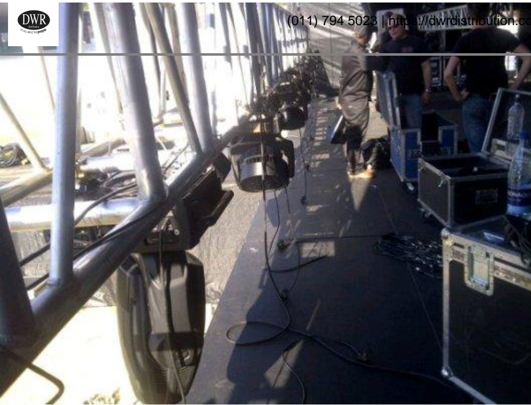
Sound Headquarters Africa

was in charge of the Main stage production and provided the sound, backline and crew as well as 8 Robe 600 E Beams and 8 Robin 600 LEDs. The rest of the large Robe retinue, controlled with a grandMA Full Size, was provided by MGG Productions (see end of article for equipment list).