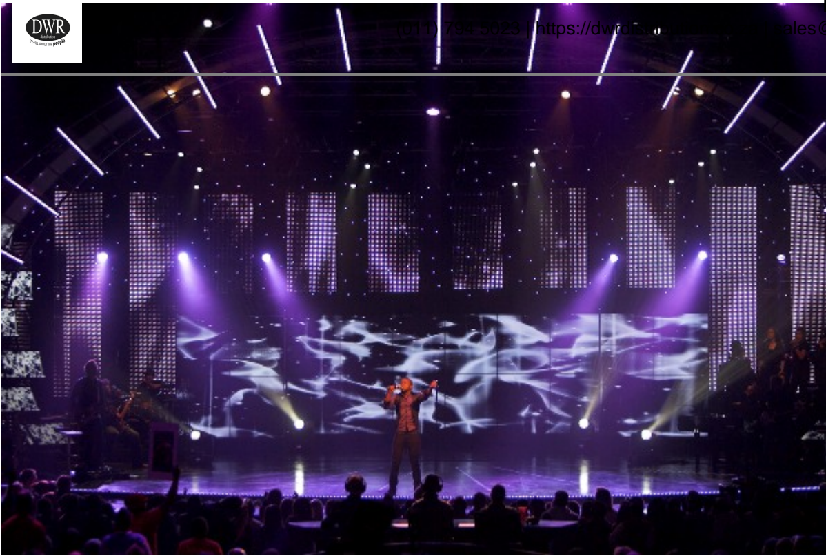
The Robes are

used for all the major stage and artist lighting and effects.