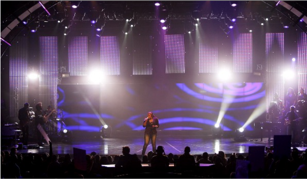
Video is central to

this year's design which has really expanded the relatively tight stage space in the Mosaiek Theatre, giving it the appearance of a much larger venue, with clean, clear eye-catching mix of LED panels and LCD screens.