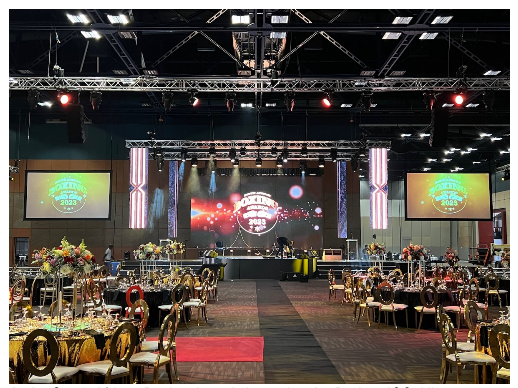
At the South African Boxing Awards hosted at the Durban ICC, Hirezone again used their grandMA3 compact XT console.