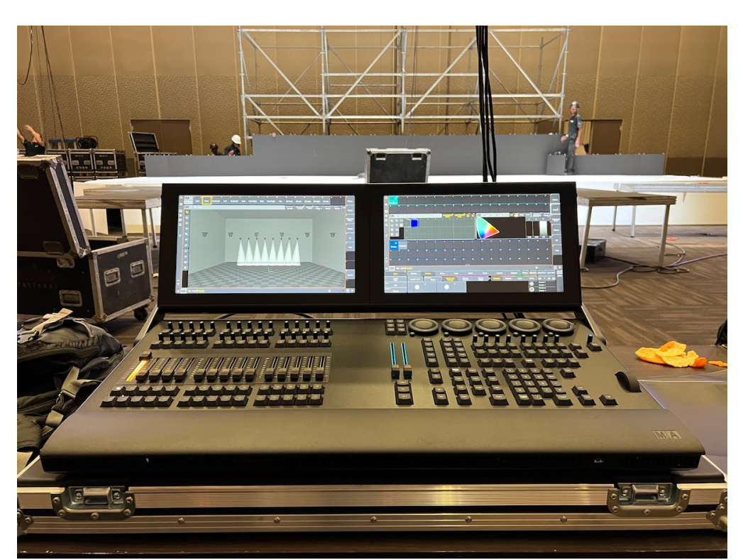
Hirezone Audio Visual's new grandMA3 has been hard at work

"We were very pleased to have finally organized our finances to proceed with the purchase," he says. "Whenever there is a high profile event, there's MA. We wanted to be part of this community as well as share the reliability and the function of MA Lighting, the ultimate destination for any LD."