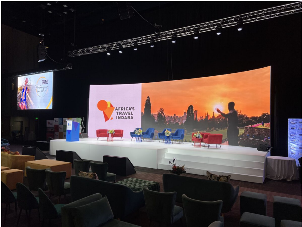
Hirezone's grandMA3 compact XT console used at an event for SATSA (Southern Africa Tourism Services Association)

industry's stabilization." He says that while it's easy to be swayed by turnover, it's important to closely monitor the margins which is surely the telltale as to whether there is a huge growth in the industry or not. "One thing for sure is turnovers have increased, but so have the costs. If you have done your research on replacing your current gear you may be in for a huge surprise. I would say gear costs have doubled in the last three years in South Africa. If your profits haven't close to doubled well then we are not growing the industry as such. I think it's important to not only trade for today but for tomorrow. We all need to work together to get our pricing up enough so that we can withstand another pandemic."