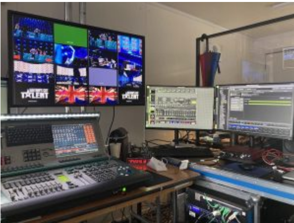
BGT Control Room

UK - The 2020 final of Simon Cowell's hugely popular TV show Britain's Got Talent wowed millions of viewers with a spectacular LED screen stage set and virtual audience, powered by Green Hippo's Hippotizer Boreal+ and Karst+ Media Servers.