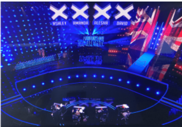
BGT Main Stage

Grubiak says he utilised a number of Hippotizer software features to achieve the looks seen during the live final broadcast: "Once we have the lighting and staging in place, I use the effects to tune brightness, masking, mirroring and then a few additional visual effects. The on-board generators seem to use little resources in the engine, but give us good effects out of the Art-Net lighting fixtures."