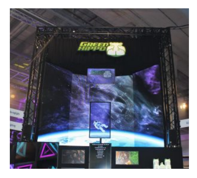
Prolight + Sound 2019 attendees could also witness Hippotizer on the Kinesys stand and also on the Martin stand. Kinesys works beautifully with Green Hippo Hippotizer Version 4.5, including integrating with Object to Output and Advanced Automation Smoothing, making the integration of moving elements with Hippotizer easier and more flexible than ever before. The demonstration fed data from a Kinesys K2 system into Hippotizer, creating a full 3D representation. SHAPE then mapped content on to the display in real time.

The Green Hippo squad also worked with Absen and Notch, to create stunning visuals on Absen's stand. Here, the display highlighted the incredible power of combining Hippotizer Montane+ RTX with Notch. Thanks to Notch's generative content creation system, the show team created stunning visuals, using input from a simple camera feed, which was then shown on an Absen LED wall. Eliminating the need to render content, generating video on the fly is the next frontier in live events.