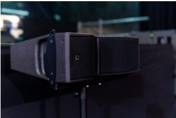
Close up of the L-Acoustics Kiva II front-fill.