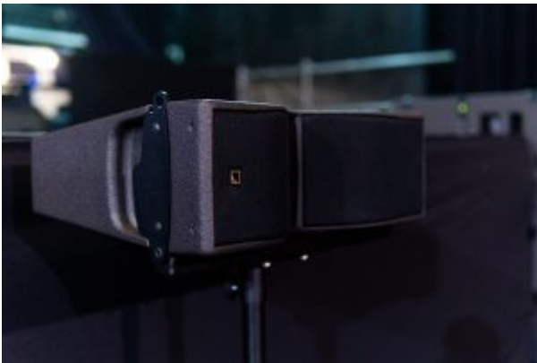
Close up of the L-Acoustics Kiva II front-fill.