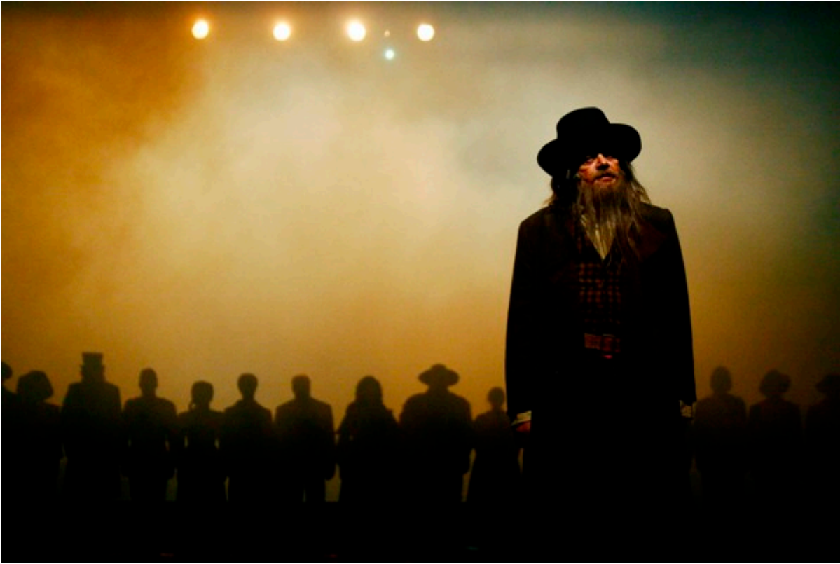
Ons vir jou