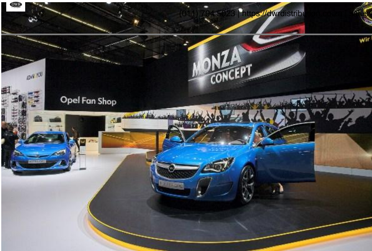
Over in Hall 8,

Opel showcase their new Monza concept car which was lit by Ralf Penkert from Atelier Stromberg ... using 36 x LEDWash 800s on a circular truss above the car podium. In addition, another 168 x LEDWash 800s are in use on other parts of the stand, supplied by schoko pro GmbH from Wiesbaden.