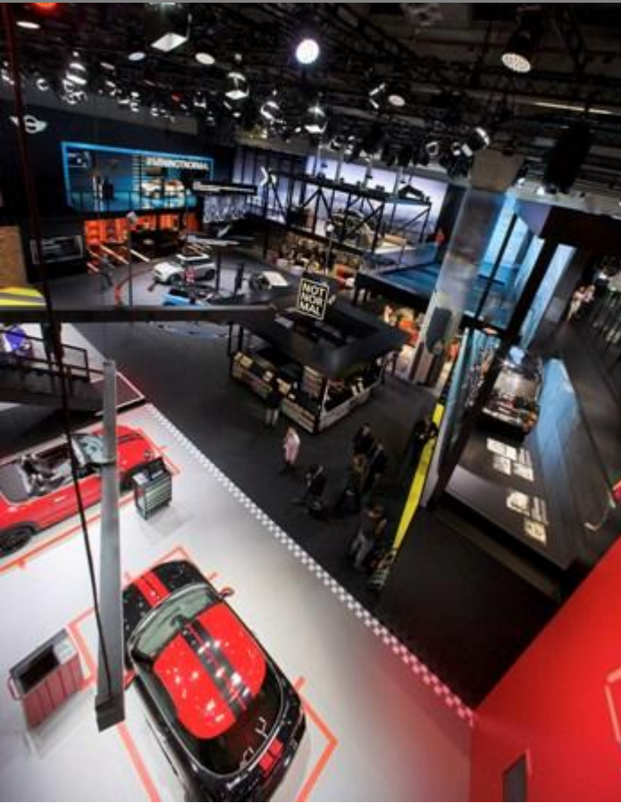
The eye-catching Hall 11 based Mini stand features 59 x

LEDWash 600 RGBWs and 36 x LEDWash SmartWhites which reinforce Mini's funky and cool lifestyle image. PRG is supplying the equipment and the lighting is designed by Tobias Heydthausen for Niyu.