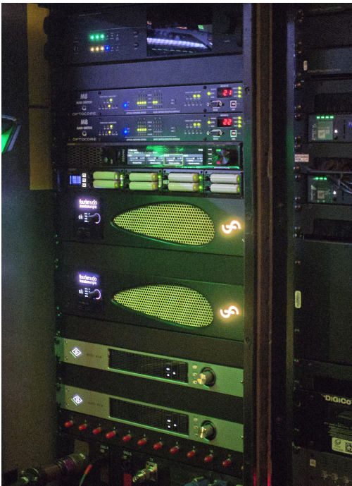
A pair of Fourier Audio transform.engines in Volbeat’s FOH rack

The Quantum8 52 console has also been an indispensable addition to the current Volbeat tour. “DiGiCo is the console that I want when I don’t know what I’m walking into and I’ve got to roll with the punches,” says Miller. “It is just so flexible, and it’s more versatile beyond just user-defined keys into all the I/O options and integration with other third parties. The Quantum8 52 , having those capabilities at your fingertips, readily available worldwide—what a major advance! It’s definitely a step in the right direction as we’ve moved back to DiGiCo on this tour.”