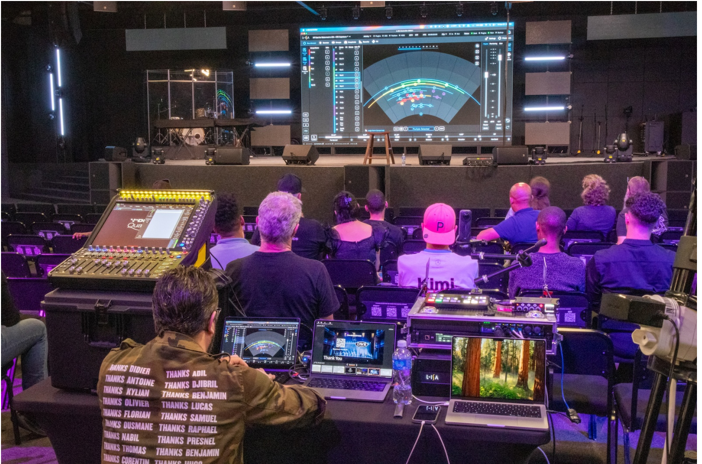
The Johannesburg event, kindly hosted by The Barn Church, welcomed over 100 attendees, while more than 60 delegates attended the Cape Town session at CRC Cape Town.