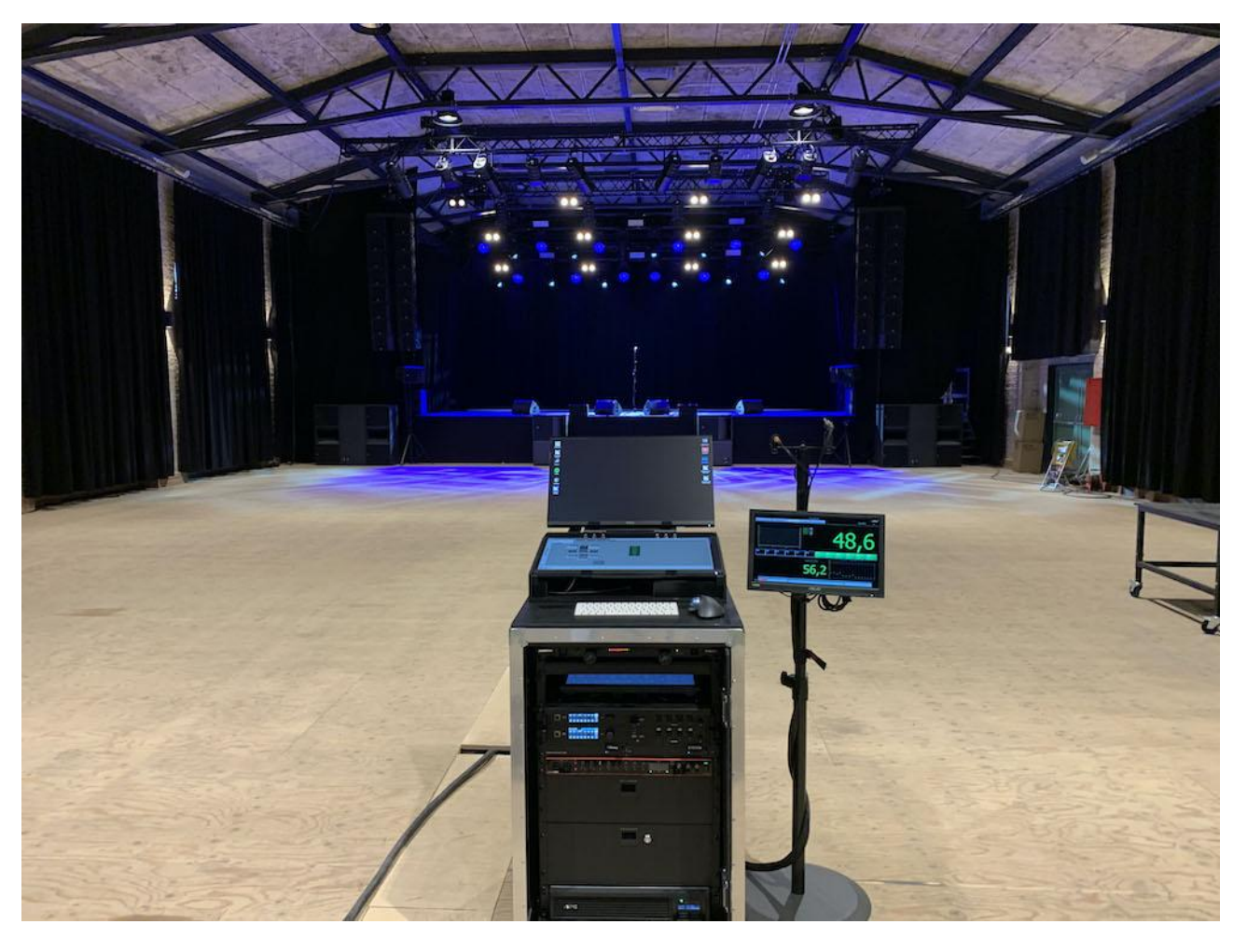
L-Acoustics newest system gets a workout at The Eksercerhuset

Fredericia, Denmark – April 2021. The Eksercerhuset, or exercise house, sits in the centre of Fredericia, home of the Royal Danish Army's Signals Regiment. It was constructed in 1863 as part of the old Bülow Barracks and has been used as a temporary performance venue for the last few years, hosting concerts and other events such as stand-up comedy. Its temporary nature meant renting in sound, light and staging, as well as wardrobe and toilet facilities for each show. In 2020, local authorities decided to make the venue a permanent performing arts center and to install the necessary infrastructure to ensure the space continues to attract quality performances. Following a demo shoot-out, the Eksercehuset team awarded the project to L-Acoustics Danish distributor, Matrix Sales, who installed Europe's first L-Acoustics K3 system.