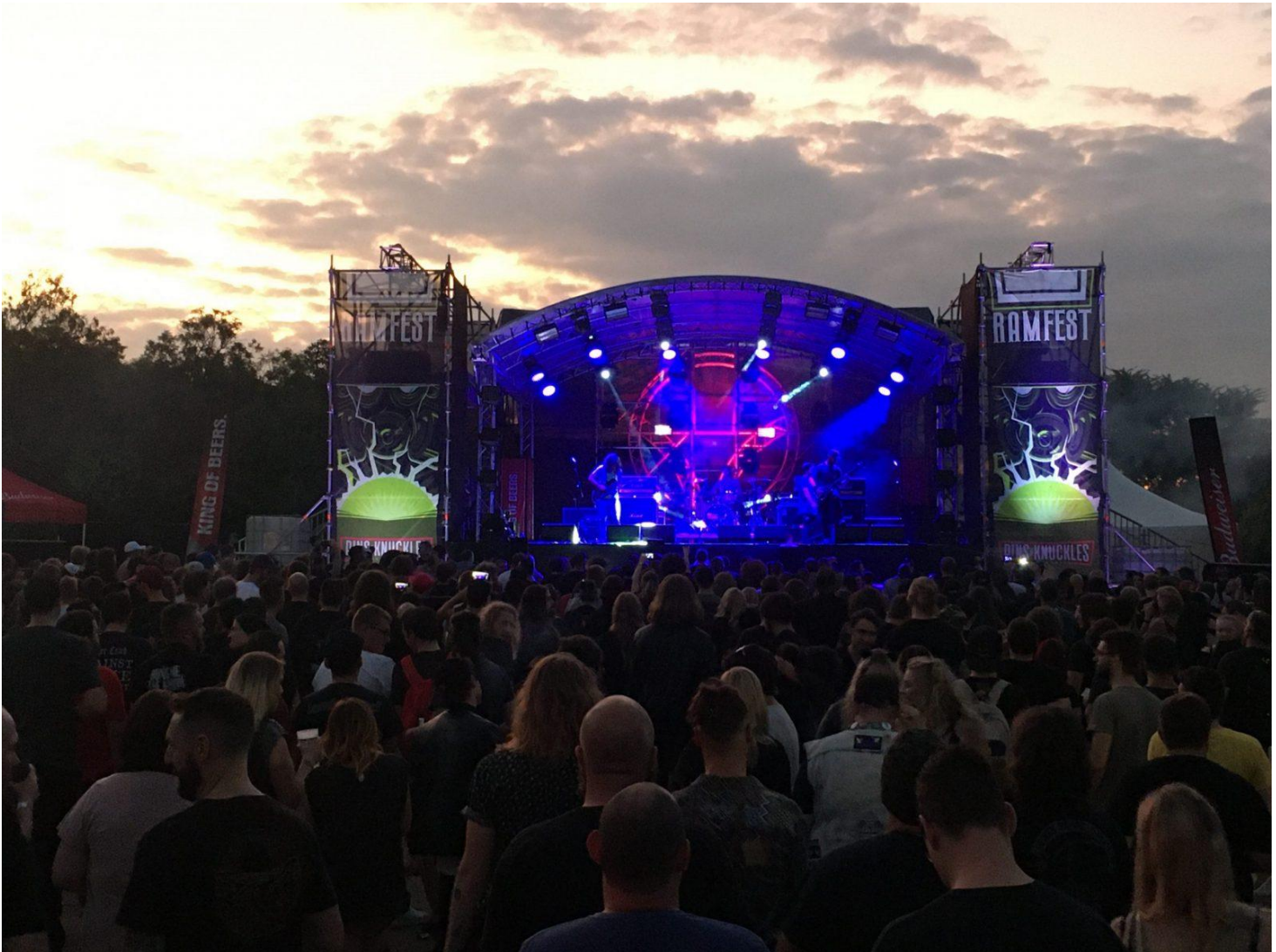
Mainstage at RAMfest, PTA on 14 March

Just days before the global emergency that the Coronavirus pandemic reached South African shores, causing a national shut-down on all public events, thousands of fans gathered at the Voortrekker Monument in Pretoria to celebrate the 2020 edition of RAMfest, South Africa's premier music festival for all things alternative.