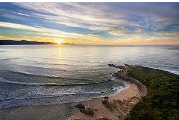
Sunrise on Lookout Beach.