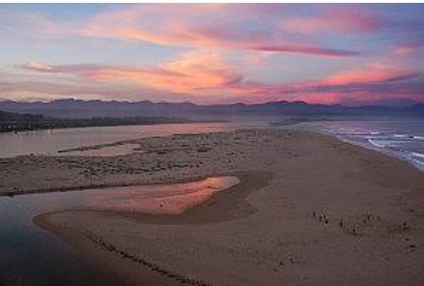
Sunset on the Kurbooms Lagoon.

Riaan points to a picturesque photo. “This is the view of the island on beautiful Keurbooms Lagoon, Plettenberg Bay. For three weeks every day, we got to experience sunrises and sunsets in one of the most beautiful parts of South Africa.”