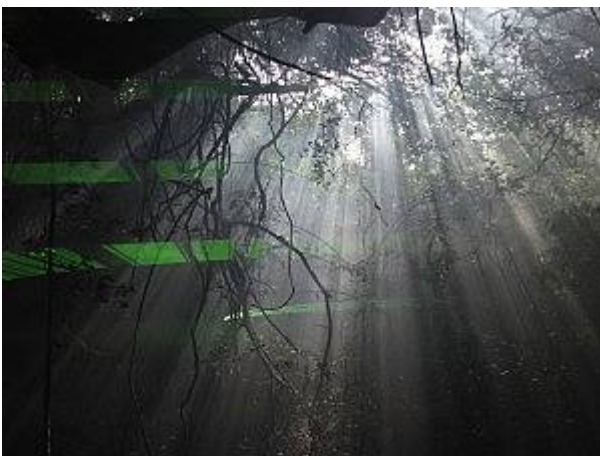
Lazers and haze created a lovely effect in the Forest Experience, also on the island.