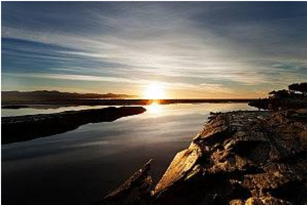
One more Plett sunrise.

While the setting is spectacular, the equipment moves from the mainland to the Island in stages, made possible by two barges, four 4x4 vehicles, ten 2-ton trailers and a tractor. The load-in takes the efforts of 20 crew members and an additional 60 casual staff per day and lots of sunblock!