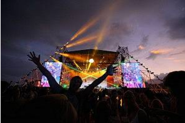
Republic of Extra Cold

Welcome to Castle Lite's Republic of Extra Cold , Stanley Island, Plettenberg Bay. It sounds exotic, and it is! On 28 Dec 2015, three thousand hip and savvy revellers gathered to enjoy SA's top acts and many unique and unexpected experiences in the extraordinary country which is the Republic of Extra Cold .