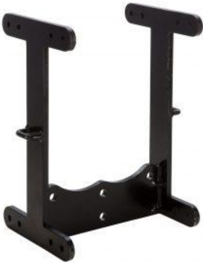
BGR70-Lighting bracket reversed