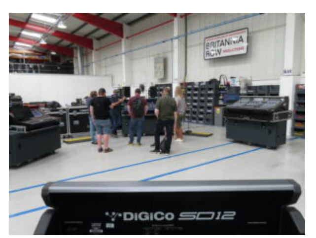
Britannia Row Productions, London

roadshow a success. The feedback from the sessions has been fantastic!"