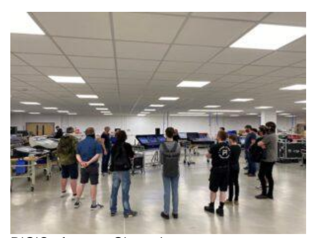
DiGiCo factory, Glenrothes

4,500 miles clocked up on the rental van; 350 engineers, end users, customers and rental companies seen in 29 days across 27 locations – the 2021 DiGiCo and KLANG roadshow was nothing short of 'epic'. The DiGiCo team toured the UK with a DiGiCo Quantum 338, Quantum 225, SD12 and a KLANG Immersive Personal Monitor package, as well as showcasing the KLANG:vokal immersive processor and the new KLANG:kontroller. Stopping at various rental companies, venues and customers along the way, the team provided two three-hour sessions a day offering a closer look at the new consoles and refreshers on the SD-Range with the company's experts.