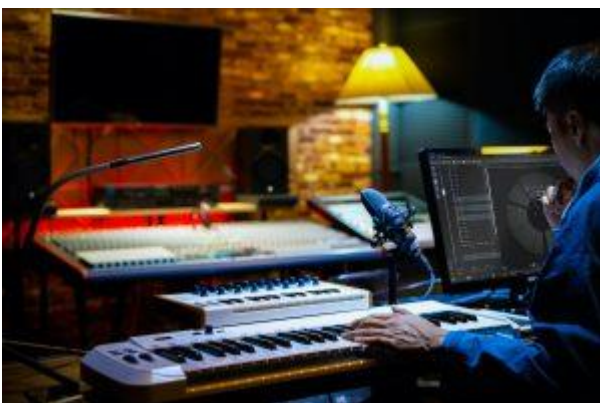
L-ISA Studio used in a home studio

Developed to improve the workflow and unleash the creative potential of all sound creators, L-ISA Studio seamlessly interfaces with leading digital audio workstations, show control software, and game engines. It also offers compatibility with various 3D audio format outputs, including Dolby Atmos and multi-channel configurations.