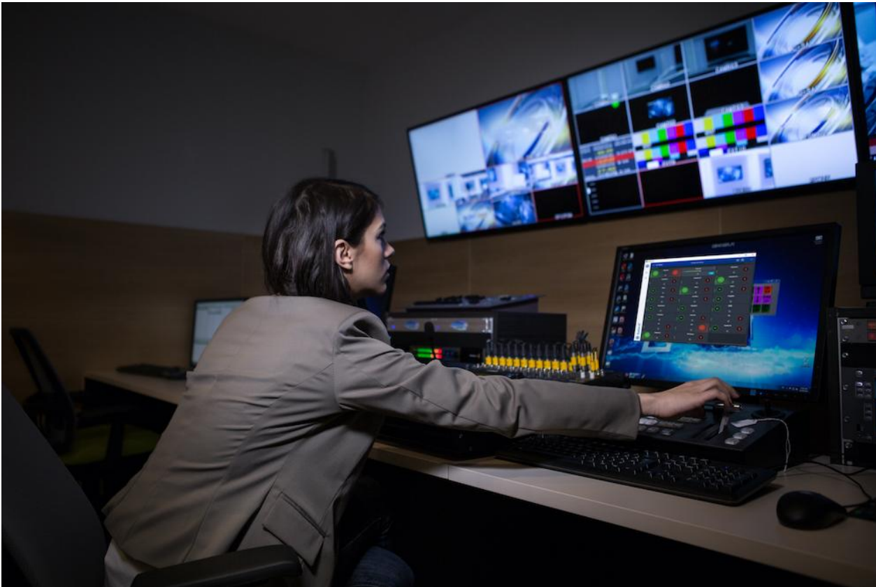
TV engineer at editor in studio. TV editor working with vision mixer in a television broadcast gallery. Woman sat at a vision mixing panel in a television studio gallery

– Agent-IC Functionality Is Now Available for Mac and Windows PCs –