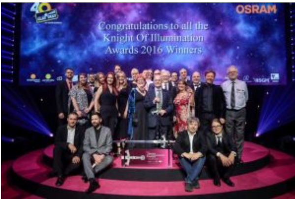
KOI Awards 2016 Winners (The Fifth Estate)