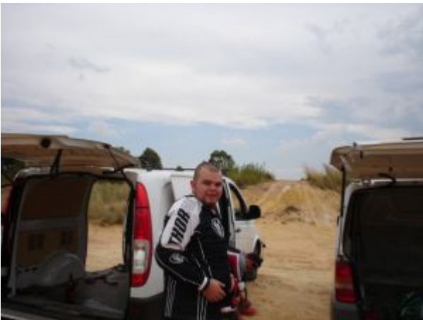
Getting ready to ride