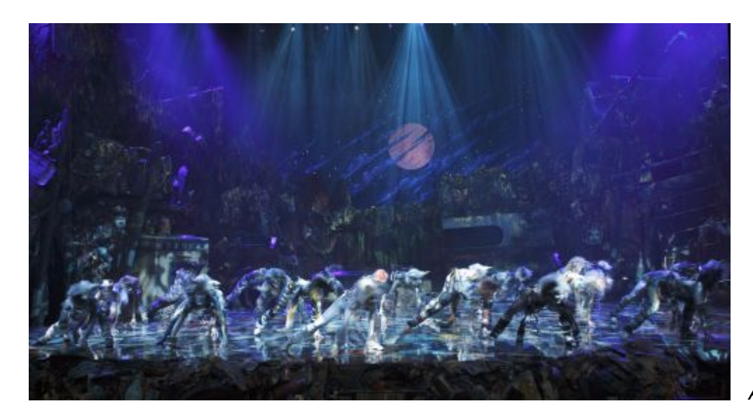
All photos with kind courtesy of