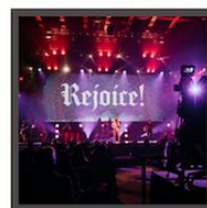
Houses of Worship