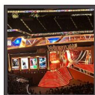
Rental & Staging