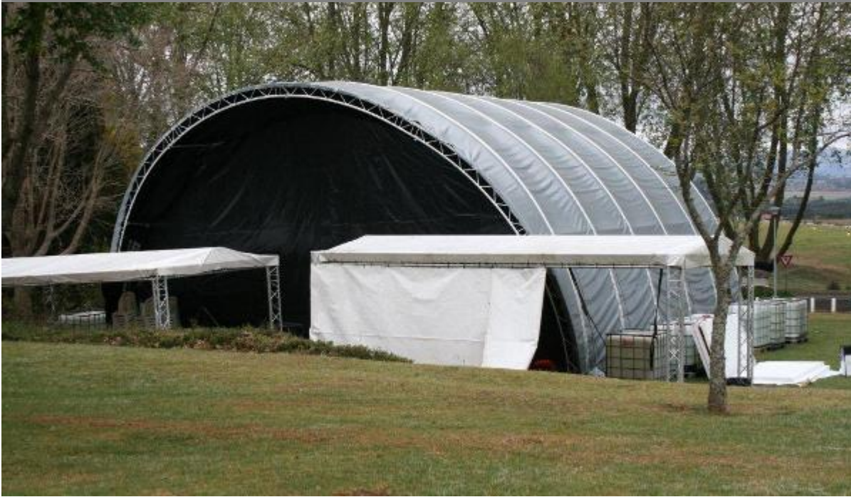
Black Coffee did