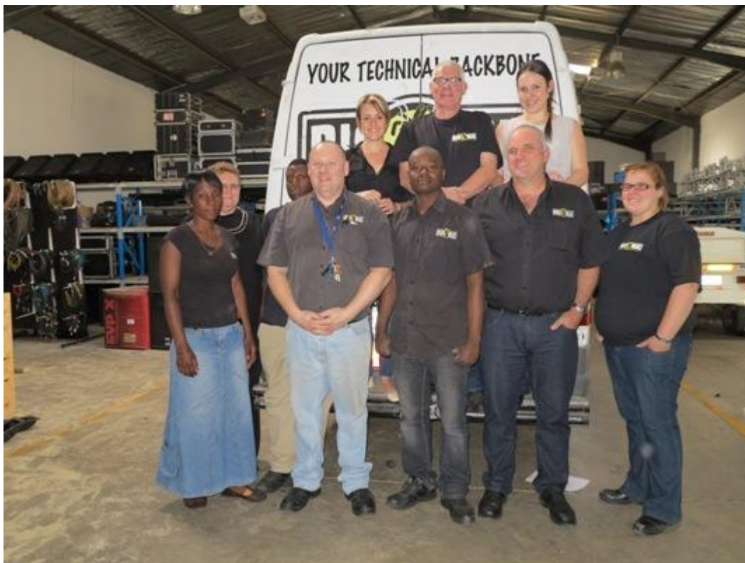
The Big Beat team

It was party night as the reggae sounds of Undivided Roots (whose main guitarist is ten years old!), floated through the warehouse of Big Beat Productions. October marked Big Beat's first year in their new premises in Pietermaritzburg, and invited clients celebrated the occasion with them.