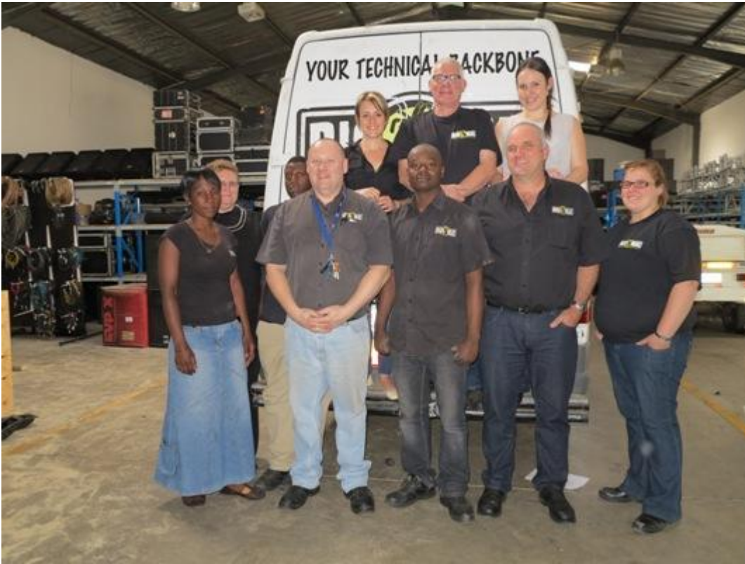
The Big Beat team

It was party night as the reggae sounds of Undivided Roots (whose main guitarist is ten years old!), floated through the warehouse of Big Beat Productions. October marked Big Beat's first year in their new premises in Pietermaritzburg, and invited clients celebrated the occasion with them.