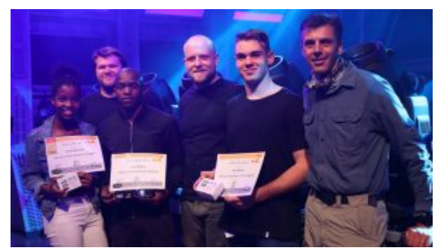
Winners of Battle of the Bands 2017

Battle of the Bands National Schools Lighting competition for amateur lighting designers took place at St Mary's School on July 20, 2017. The competition represents young and upcoming lighting designers who went head-to-head working off the MA platform with a Robe rig.