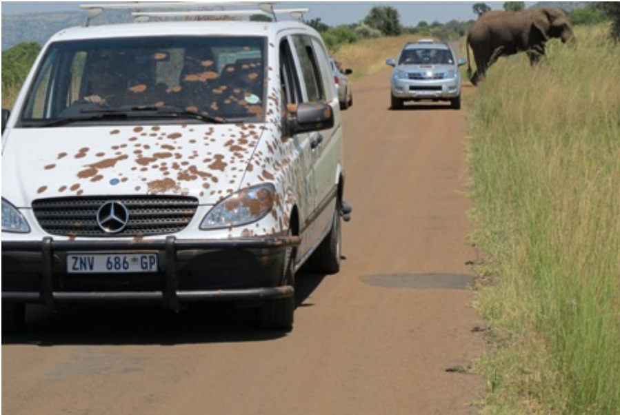
Just the elephant having a bit of fun... who says they can't do a great paint job!