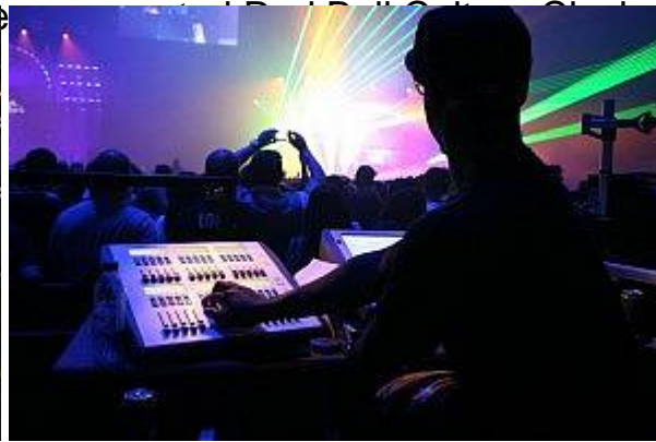
at Earls Court