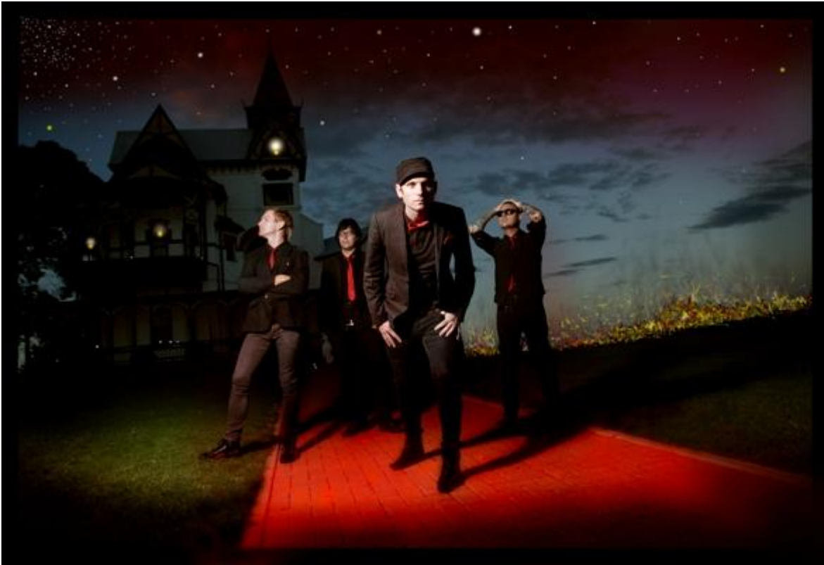
U2 were not always

famous. Go see The Parlotones up close and personal while you can.... we have an inkling they are going to be even bigger.