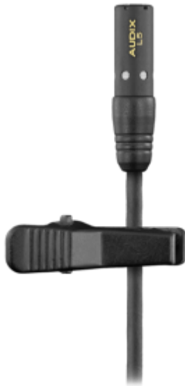
L5 Micro Lavalier Condenser Microphone

The @Audix Wired and Wireless headworn and lavalier microphones are professional solutions for the stage, broadcast, lectures, speeches, podcasts, television, film, and video.