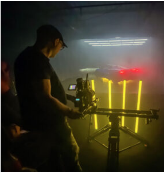
Astera GOTY Award Lotus Emira Launch

Industry-voted awards are always a great endorsement for any brand or product, so Astera is delighted to announce that its hugely popular Titan Tube is a 2021 Pro Moviemaker "Gear of The Year"™ winner in the "lighting innovation"™ category!