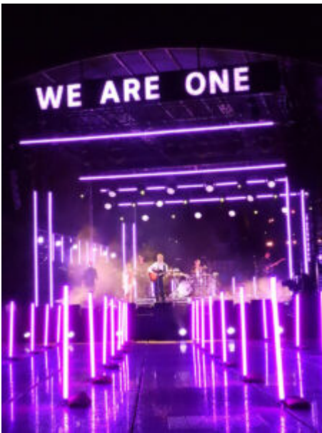
Astera GOTY Award We Are One Concert Sydney NYE.

Readers, followers, and fans of the quarterly magazine "that also runs a regular e-newsletter and digital portal" are encouraged to vote online based on equipment and services that have "made a significant difference" to them throughout the year.