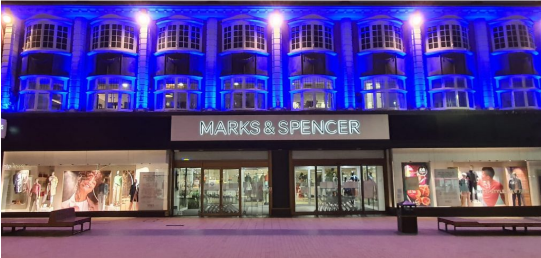
Anolis Blue Bromley High Street

The scheme for lighting the façade above key shopfronts was designed by Matt Owen from Technical Entertainment Services working for (the London Borough of) Bromley Council, and the lighting comprises a mix of Anolis Divine 160s and ArcPad 48 fixtures – over 50 in total, which are attached to the base of the façade.