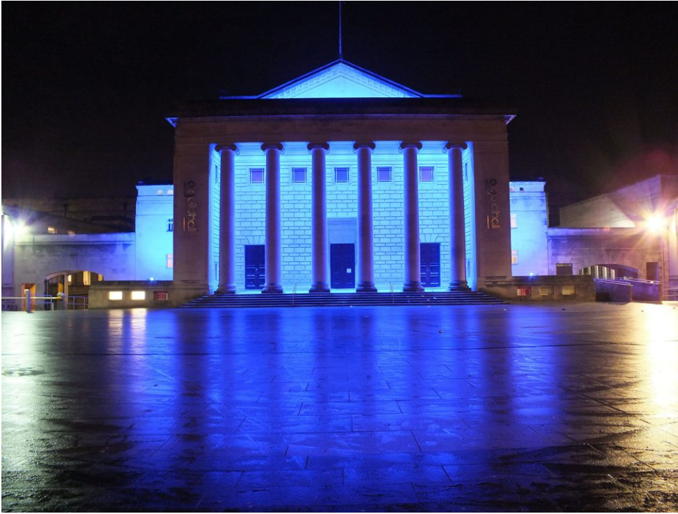
Anolis Blue O2 Guildhall Southampton

Opened in 1937, the main concert / show venue in this building is now managed by the Academy Music Group and is one of the most popular live music showcases on the UK theatre / town hall touring circuit. That part of the building is currently closed under the lockdown, however, the exterior façade is still shining bright ... lit with Anolis ArcSource 96 integrals and ArcPad 94s.