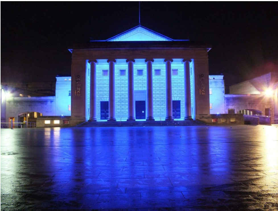
Anolis Blue O2 Guildhall Southampton

Opened in 1937, the main concert / show venue in this building is now managed by the Academy Music Group and is one of the most popular live music showcases on the UK theatre / town hall