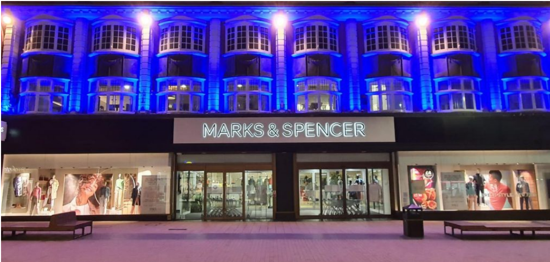
Anolis Blue Bromley High Street

The scheme for lighting the façade above key shopfronts was designed by Matt Owen from Technical Entertainment Services working for (the London Borough of) Bromley Council, and the lighting comprises a mix of Anolis Divine 160s and ArcPad 48 fixtures – over 50 in total, which are attached to the base of the façade.