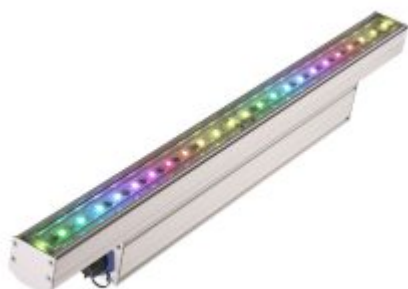
Anolis Arline DVP without diffuser

It is available in a variety of lengths that are quick and easy to daisy-chain, linking power and data.