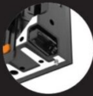
● Flip-over protective corner (For NT2.6 and NT2.9 standard version)

Adopts anti-collision design to avoid direct collision between LEDs and the ground, thereby effectively protecting the LEDs on the edge.