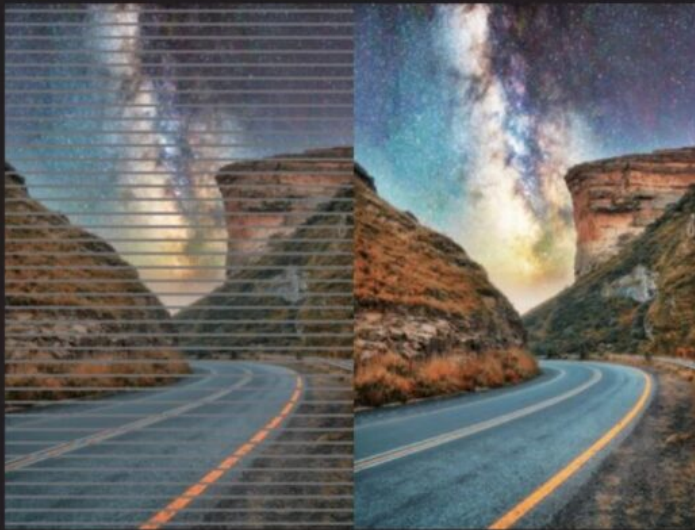
Low refresh rate

Superior visual performance with high brightness and high refresh rate, ready to create stunning event moments at any time.