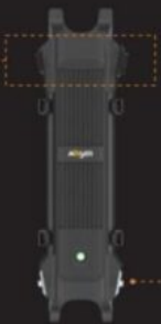
● Outdoor power box

Power twist cable connectors for power supply