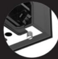
● Edge protrusion design