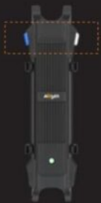
● Indoor power box

The NT series incorporates high-quality cable connectors for power and data transmission to achieve stable power and data signal transmission, and are equipped with high-quality cables to further reduce the failure rate.