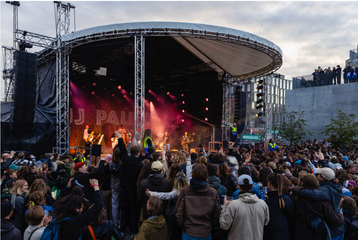
Spot Festival.