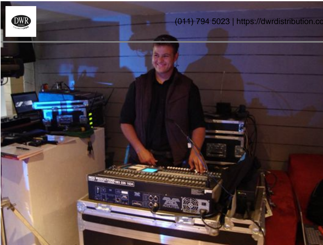
Things went well for the