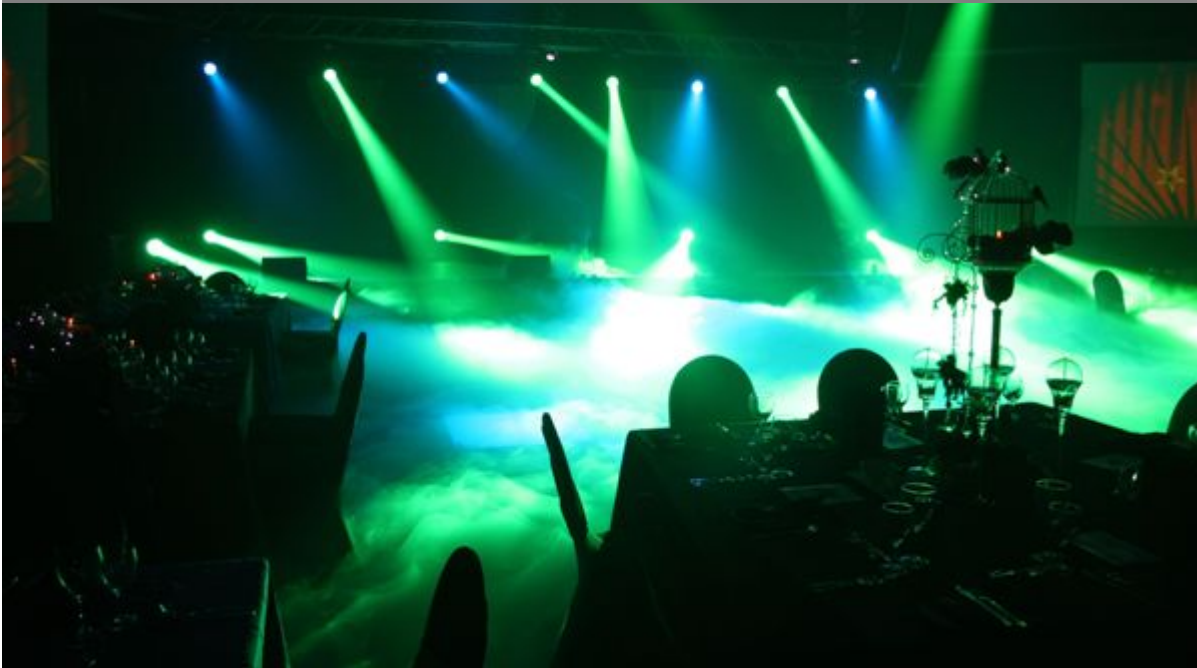
The second one