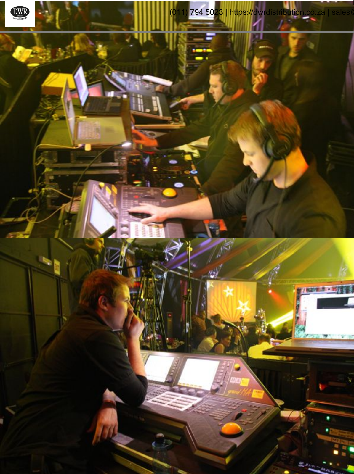
A memory I have