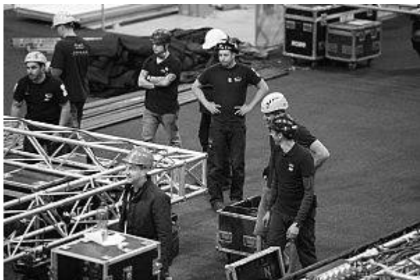
Respect to the MGG crew