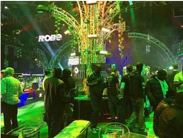
DWR stand at Mediatech