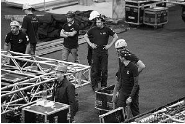
Respect to the MGG crew